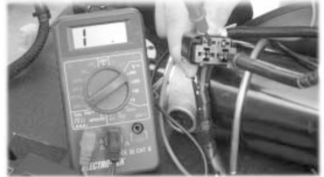
Figure 2.49. M2 Harness